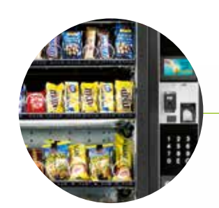
An elegant and refined model